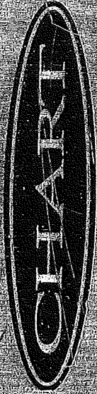
CHART HEAT EXCHANGERS L.P. LA CROSSE WISCONSIN 54601 MANUFACTURED UNDER ONE OR MORE OF THE FOLLOWING PATENTS 4272462 4297775 MADE IN U.S.A.

MANP EXTERNAL 4.7 BARG VOL: L 2000 1530 TARE: 5.805 KG FULL: 7.936 KG TEST DATE: 03/03 ITEM NO. W40001