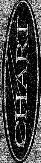
CHART HEAT EXCHANGERS L.P. LA CROSSE WISCONSIN 54601 - MANUFACTURED UNDER ONE OR MORE OF THE FOLLOWING PATENTS 4272462 4297775 MADE IN U.S.A.

* MAMP EXTERNAL 68 PSIG P.O.# 4500023994 ITEM# W40001